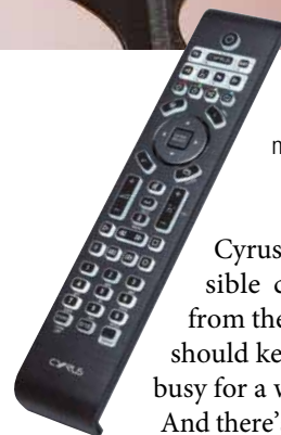
◀ Remote for the Phono Signature lights up when touched

Each input has a choice of MM or MC, with gain, impedance and capacitance each adjustable in several steps – and all 'on the fly' and via remote control!