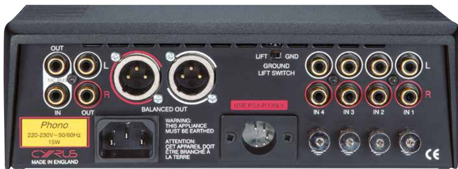
▲ Four phono inputs, outputs on RCA and XLR, connection for additional power supply and ground - this baby is quite flexible.

And there's more: single-ended and balanced outputs allow it to connect to any system configuration. But then after all, the declared goal of the Signature is to